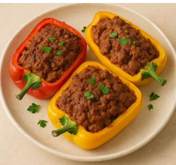
Plate warm, topped with extra cheese or fresh herbs if desired.