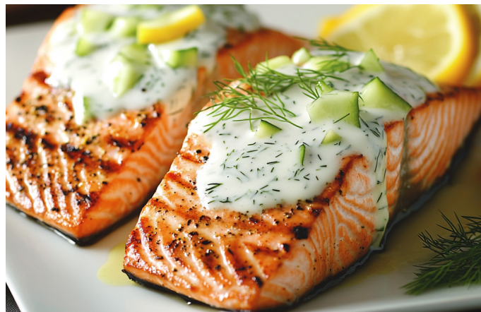
Grilled Salmon with Lemon-Dill Sauce

Calories: 280 | Protein: 22g | Carbohydrates: 8g | Fats: 16g | Fiber: 3g | Cholesterol: 60mg | Sodium: 450 mg | Potassium: 500mg