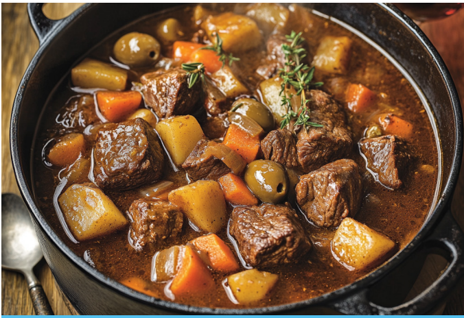
Beef Stew with Root Vegetables and Olives