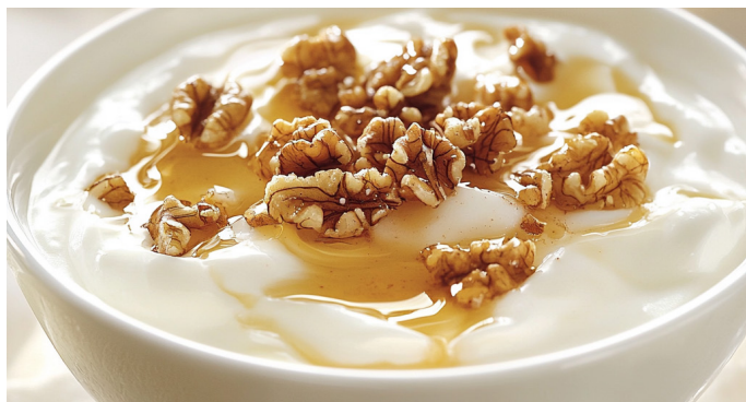
Greek Yogurt with Honey and Walnuts

Servings: 2 | Prep Time: 5 mins | Cook Time: 0 mins