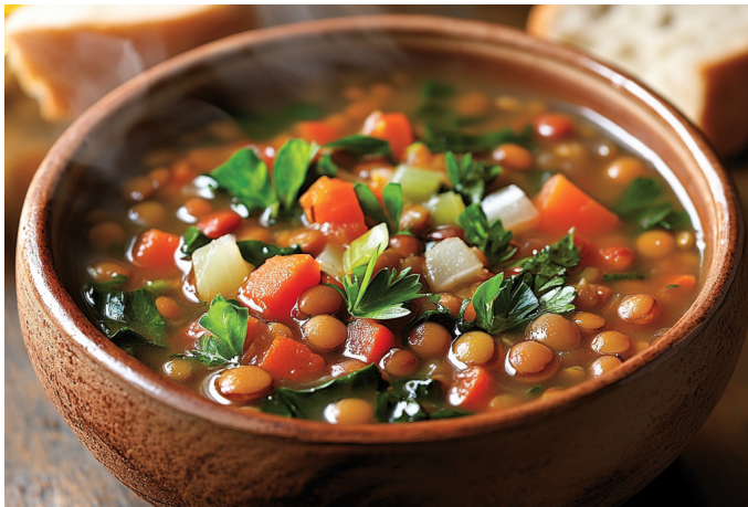
Hearty Mediterranean Lentil Soup with Spinach and Tomatoes

Servings: 6 | Prep Time: 10 mins | Cook Time: 45 mins