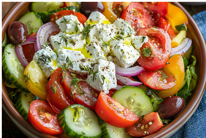
Greek Village Salad with Homemade Tzatziki Dressing

Servings: 4 | Prep Time: 20 mins | Cook Time: 0 min