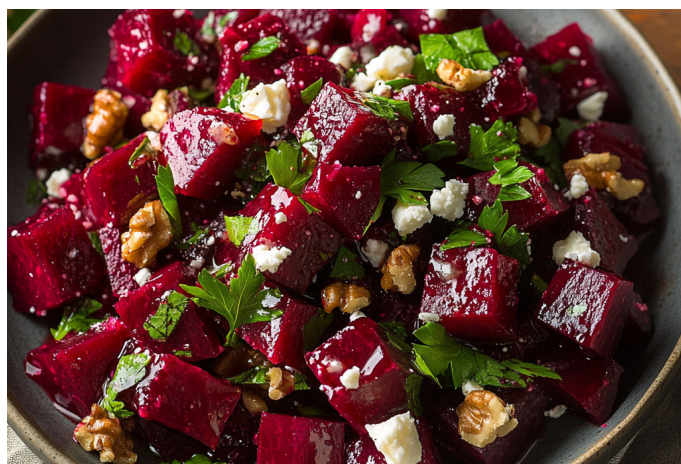
Roasted Beet and Walnut Salad

Calories:320 | Protein: 12g | Carbohydrates: 15g | Fats: 24g | Fiber: 3g | Cholesterol: 30mg | Sodium: 580mg | Potassium: 400mg