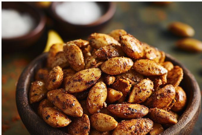
Spiced Roasted Almonds

Servings: 8 | Prep Time: 5 mins | Cook Time: 10 mins