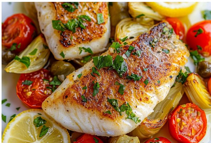
Sea Bass with Artichokes and Capers

Servings: 4 | Prep Time: 15 mins | Cook Time: 20 mins