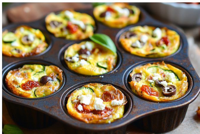
Zucchini and Olive Mini Frittatas

Calories:210 | Protein: 8g | Carbohydrates: 8g | Fats: 18g | Fiber: 4g | Cholesterol: 0mg | Sodium: 150mg | Potassium: 260mg