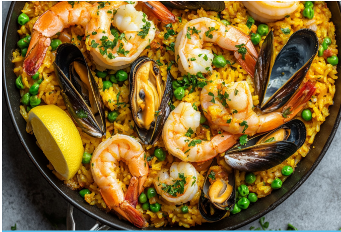
Seafood Paella with Saffron and Fresh Herbs

Servings: 6 | Prep Time: 20 mins | Cook Time: 40 mins