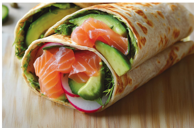
Smoked Salmon and Avocado Wrap with Lemon-Dill Yogurt

Calories: 350 | Protein: 28g | Carbohydrates: 34g | Fats: 12g | Fiber: 6g | Cholesterol: 60mg | Sodium: 400mg | Potassium: 500mg