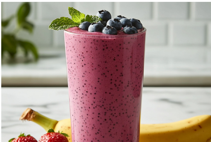
Berry Bliss Breakfast Shake

Servings: 2 | Prep Time: 5 mins | Cook Time: 0 mins