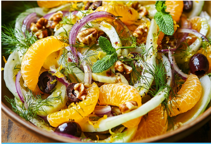
Fennel and Orange Salad with Citrus Dressing

Servings: 4 | Prep Time: 20 mins | Cook Time: 0 mins