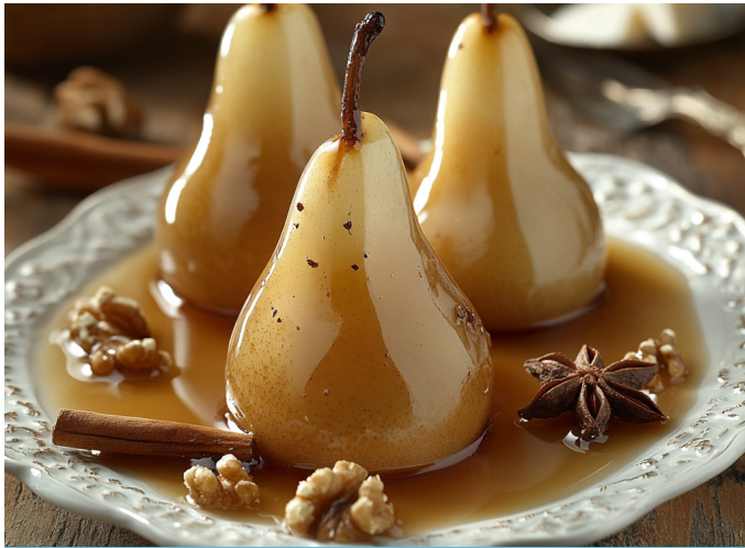
Mediterranean Poached Pears

Servings: 4 | Prep Time: 10 mins | Cook Time: 25 mins