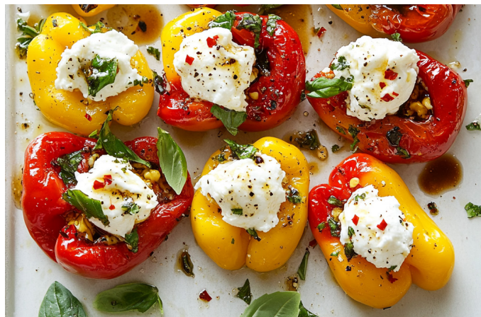
Roasted Pepper and Goat Cheese Bites

Calories: 100 | Protein: 7g | Carbohydrates: 8g | Fats: 4g | Fiber: 1g | Cholesterol: 20mg | Sodium: 450mg | Potassium: 300mg