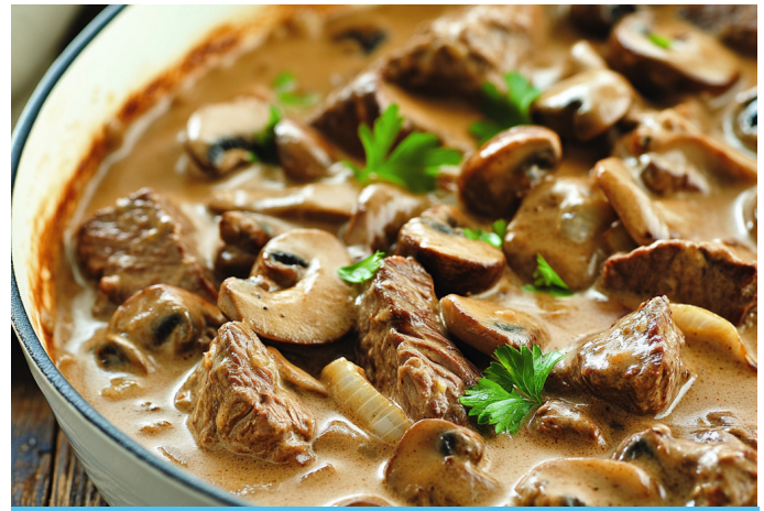
Beef Stroganoff with Mushrooms and Greek Yogurt

Servings: 6 | Prep Time: 20 mins | Cook Time: 2 hours