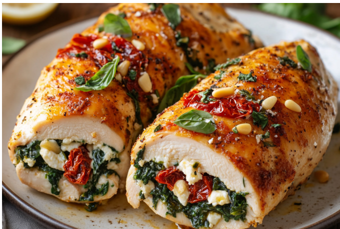
Mediterranean Stuffed Chicken Breast with Spinach and Feta