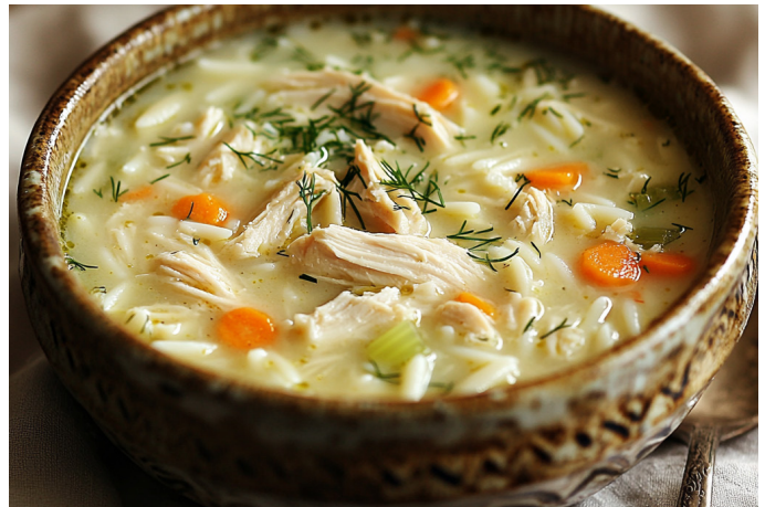
Classic Greek Avgolemono Soup with Lemon and Chicken

Calories: 240 | Protein: 12g | Carbohydrates: 38g | Fats: 5g | Fiber: 15g | Cholesterol: 0mg | Sodium: 300mg | Potassium: 800mg