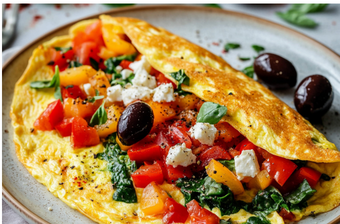
Mediterranean Veggie Omelette

Servings: 2 | Prep Time: 10 mins | Cook Time: 15 mins