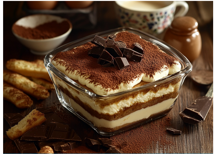
Tiramisu with Mascarpone and Espresso

Calories: 240 | Protein: 2g | Carbohydrates: 57g | Fats: 3 g (if adding walnuts and feta) | Fiber: 5g | Cholesterol: 0mg | Sodium: 50 mg (if adding feta) | Potassium: 210mg