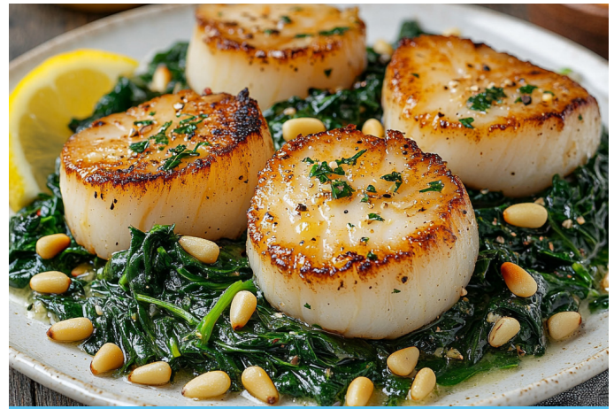
Garlic Butter Scallops with Spinach and Pine Nuts

Calories: 380 | Protein: 28 | Carbohydrates: 52g | Fats: 10g | Fiber: 3g | Cholesterol: 95mg | Sodium: 780 mg | Potassium: 600mg