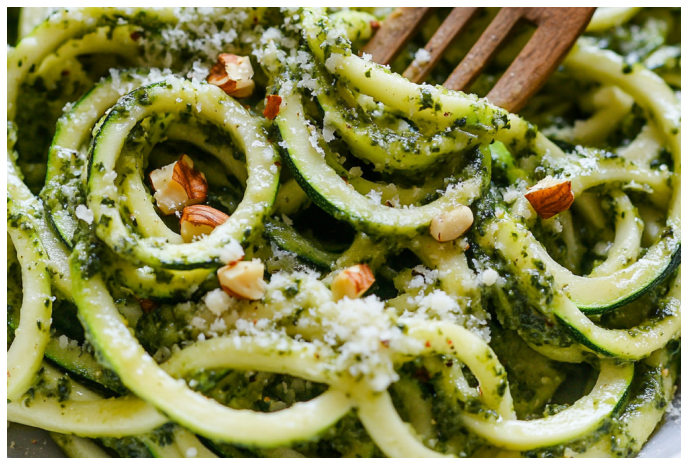
Zucchini Noodles with Walnut Pesto

Servings: 4 | Prep Time: 15 mins | Cook Time: 5mins