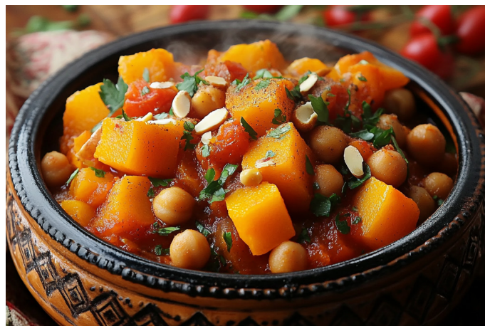
Butternut Squash Tagine

Calories: 290 | Protein: 8g | Carbohydrates: 8g | Fats: 26g | Fiber: 3g | Cholesterol: 11mg | Sodium: 200 mg | Potassium: 512mg