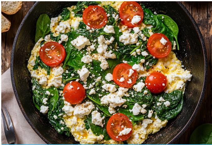
Spinach and Feta Scramble

Servings: 2 | Prep Time: 5 mins | Cook Time: 10 mins