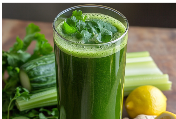
Green Power Detox Juice

Calories: 210 | Protein: 8g | Carbohydrates: 36g | Fats: 4.5g | Fiber: 6g | Cholesterol: 10mg | Sodium: 95mg | Potassium: 400mg