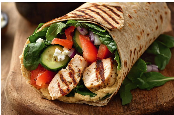
Grilled Chicken and Hummus Wrap with Fresh Veggies

Servings: 4 | Prep Time: 15 mins | Cook Time: 10 mins