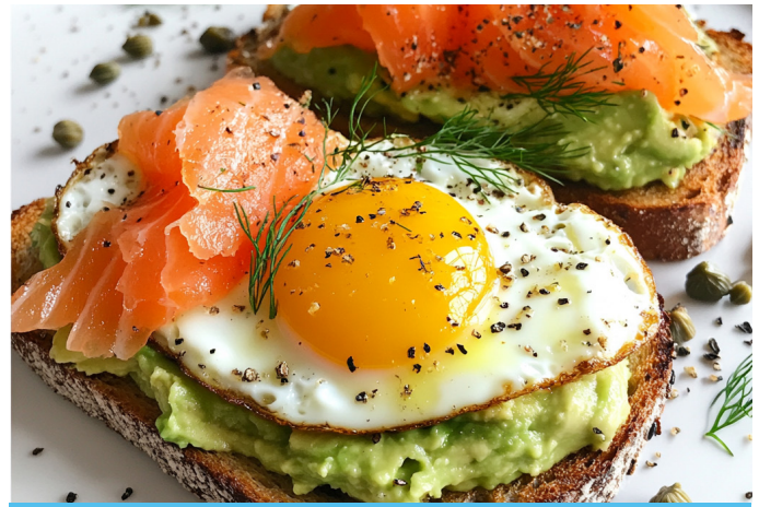
Smoked Salmon and Avocado Egg Toast

Calories: 345 | Protein: 20g | Carbohydrates: 8g | Fats: 27g