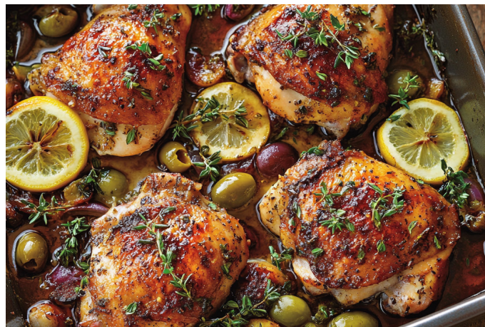
Herb-Roasted Chicken Thighs with Lemon and Olives

Servings: 4 | Prep Time: 20 mins | Cook Time: 30 mins