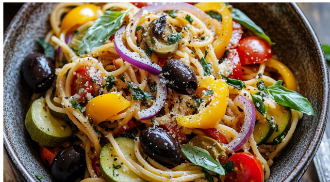
Mediterranean Vegetable Spaghetti

Calories: 380 | Protein: 12g | Carbohydrates: 54g | Fats: 10g | Fiber: 4g | Cholesterol: 11mg | Sodium: 300mg | Potassium: 404mg