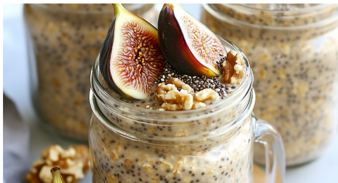
Mediterranean Oats with Chia Seeds

Calories: 250 | Protein: 12g | Carbohydrates: 18g | Fats: 15g | Fiber: 1g | Cholesterol: 10mg | Sodium: 35mg | Potassium: 200mg