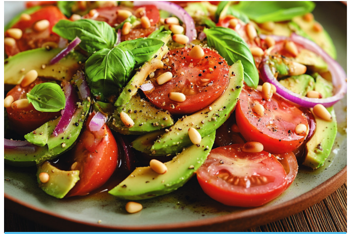
Avocado and Tomato Salad with Pine Nut Dressing

Calories: 280 | Protein: 3g | Carbohydrates: 25g | Fats: 20g | Fiber: 6g | Cholesterol: mg | Sodium: 150mg | Potassium: 480mg