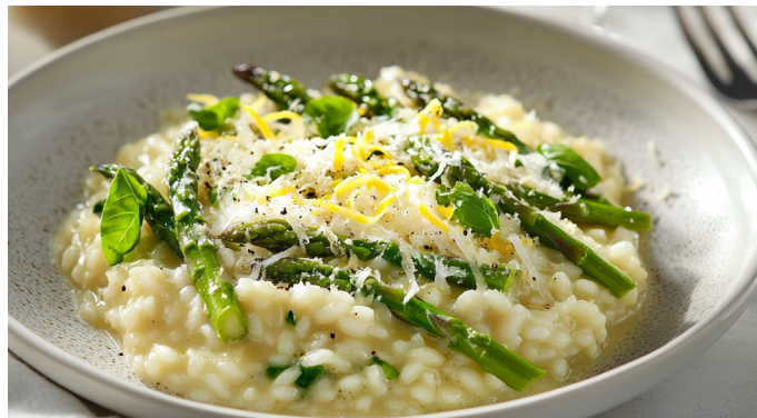
Lemon and Asparagus Risotto with Parmesan

Servings: 4 | Prep Time: 10 mins | Cook Time: 30 mins